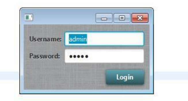
Figure 2: Masterdose login example

Masterdose runs on any Windows, Linux and Macintosh application, an example of the login on Masterdose is given in Figure 2. For the Windows and Linux platforms, a Java Runtime Environment is needed to run and download Masterdose. The Macintosh platform needs MacOS Runtime.